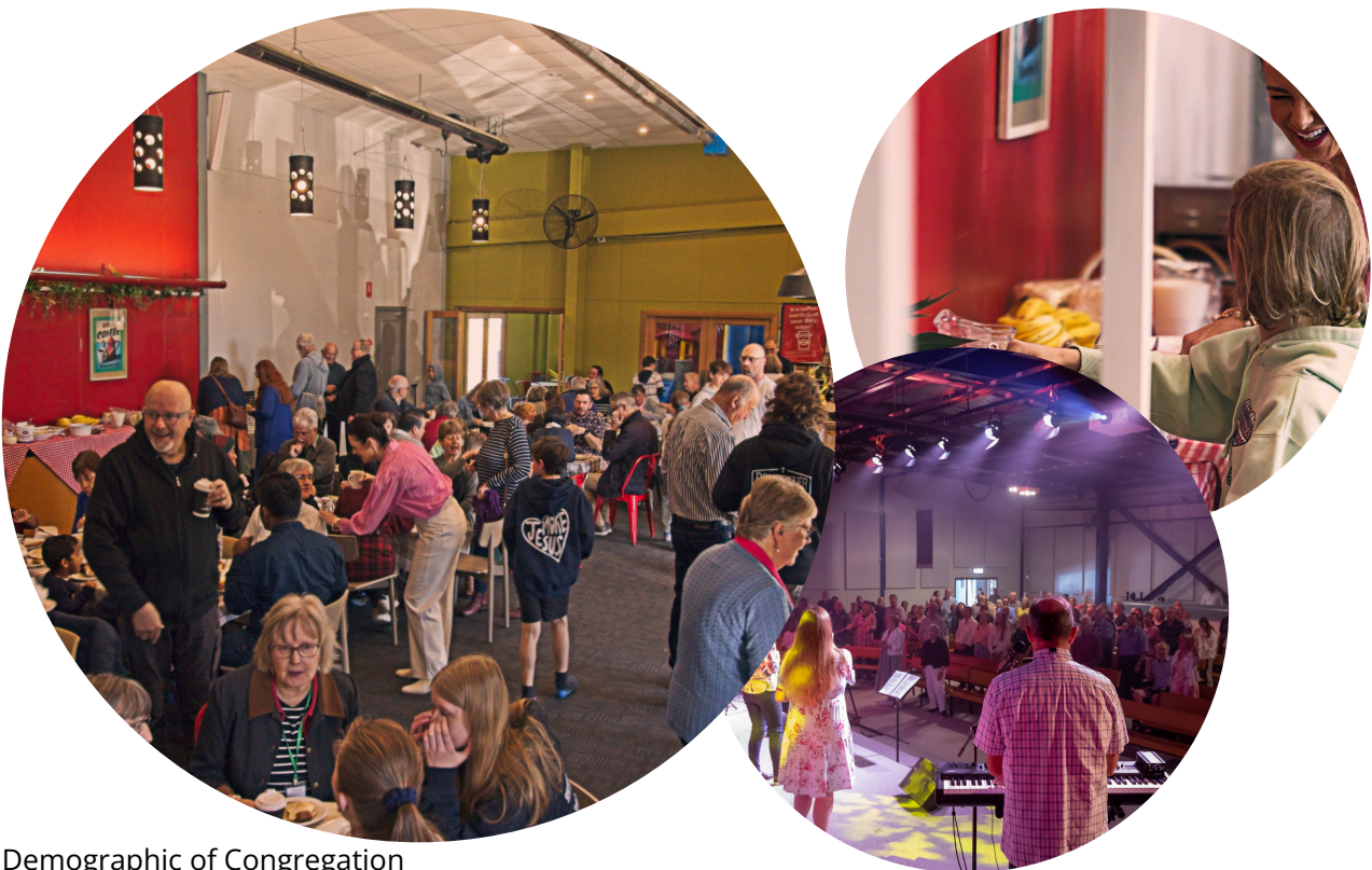
Demographic of Congregation

Small Group participation has returned to its pre-COVID average of 68% of Sunday attendance and the percentage of congregants serving in some capacity has also returned to its pre-COVID average of 65% of Sunday attendance.